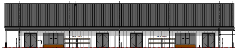
The front view of our 2 new blocks