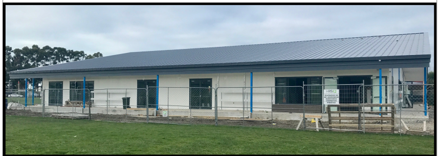
ABOVE - The inside and outside photographs is of the block closest to the hall where Totara team (Y 7/8) will move in to. Both blocks are being built to the same design.

This shows the proposed landscaping plan around our new blocks (existing hall grey shaded area bottom right).